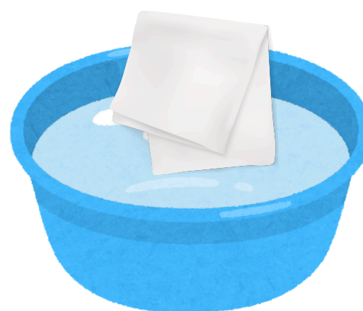
Bed bath water