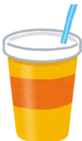
Beverages (except water)